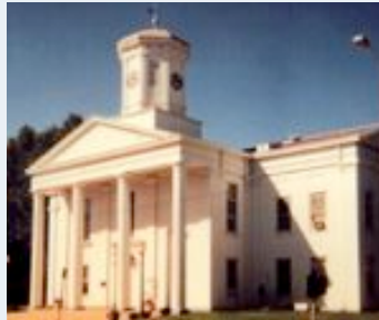
HARRISON CO. COURTHOUSE