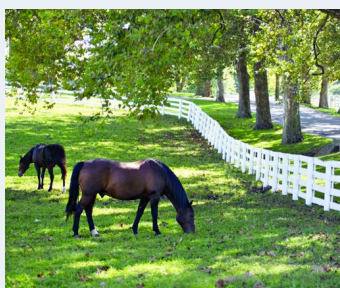
KENTUCKY HORSE PARK