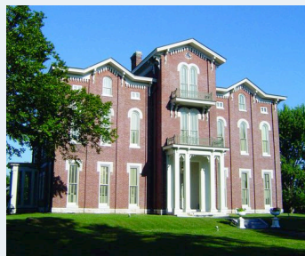
WHITE HALL HISTORIC SITE