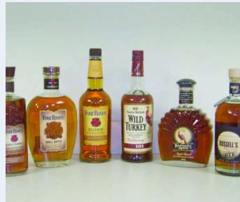
FOUR ROSES & WILD TURKEY