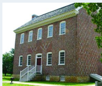
WILLIAM WHITLEY HOUSE