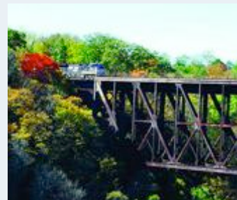
HIGH BRIDGE HISTORIC PARK